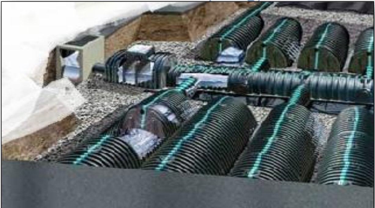
Fig: underground pipelining and drainage channels.

The connected devices will make the drainage system more comfortable to operate, monitor, control with less resources and to take necessary actions.